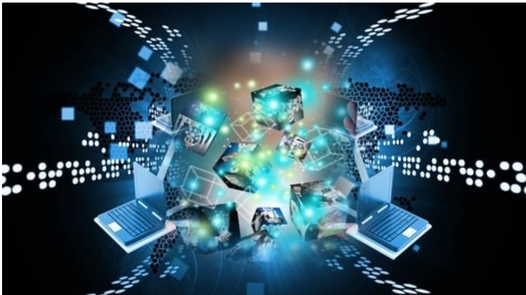
Figure 2. Shahid Singh – 2021, Art and New Media

New media are social arrangements or organizations that form around devices and practices, and communication activities or practices we do to develop and use these devices, encouraging us to look at our environment in terms of artifacts or devices that provide and expand our communication capabilities (Deuze, 2005). Again, the relevance of such an approach to new media theory and the study of social phenomena lies in the assumption that humans and machines are interconnected rather than influencing or directing one another. Therefore, the popularity and corresponding commercialization of collaborative technologies at home and in the workplace (Virilio, 1997), our constant participation and departure from a wide variety of social networks (Wellman, 2002), and the experience in a global network society (Castells, 2005) characterizing new media should be seen as discernable works, activities and arrangements (Deuze, 2005). The concept of new media can be defined as digital media and electronic media. In this context, the importance of the relationship between media and art emerges. We can present this importance with the Figure 2 image.